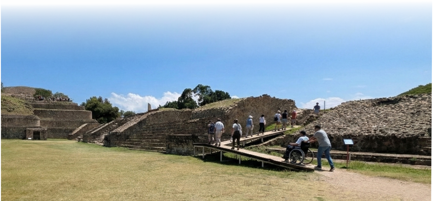
View of the ramp leading to the top of the Ballcourt