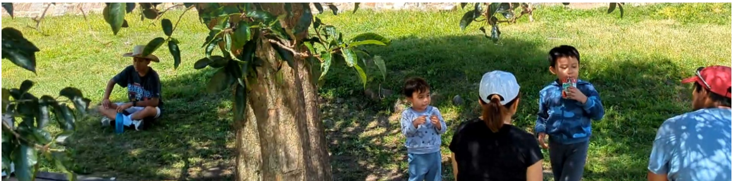
First rest stop in front of Building L on the west side of the Grand Plaza

There is a resting tree at the halfway point (see map). Use it.